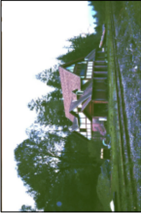
2. Cookhouse, debris, and soil stockpile.