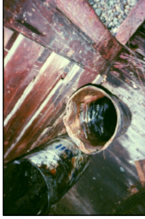
6. Detail of oil in bucket.