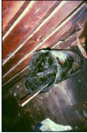
5. Detail of grease in drum.