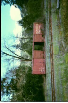
3. Boxcar used to store oil and grease drums.