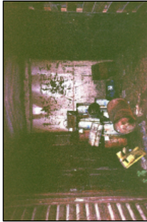
4. Drums inside boxcar.