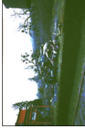
9. Scrap metal adjacent to track.